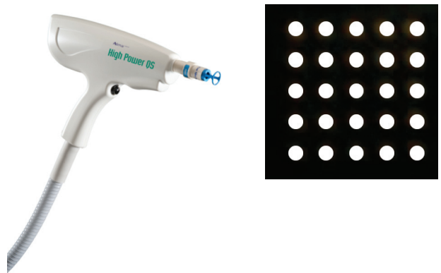
Figure 1. High Power Pixel QSW Nd:YAG 1064-nm laser hand piece and its 5x5 pixel matrix on a 0.5 x 0.5 cm footprint.

The new Pixel QSW module is a fractional, high power, short pulse, 1,064nm Nd:YAG laser used with the Harmony XL platform (Alma Lasers Ltd., Caesarea, Israel). Since the Q-Switched 1,064-nm wavelength laser beam is only modestly absorbed in melanin and hemoglobin, it enables deep penetration to the papillary and reticular dermis. The laser beam is fractionated by a passive refractive optical element, creating a 5x5 matrix of 25 microscopic holes (~200µm in diameter) and distributed within a 5mm x 5mm footprint (Figure 1).