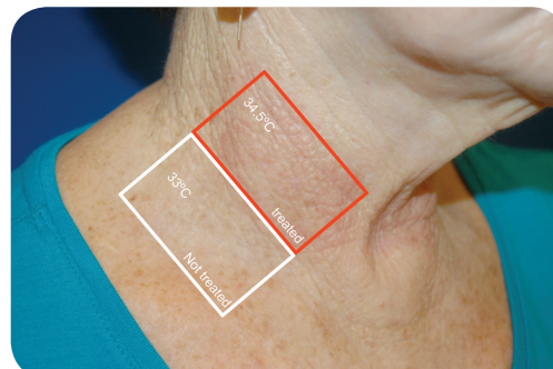
Figure 2. Treatment end-points after 1000mJ/P at 5Hz; Upper red rectangle showing erythema, skin warmth 1.5-2 degrees centigrade vs no treatment area (lower white rectangle).

Post-treatment care included only sun protection lotion. Patients were followed up 1 week, 3 and 6 months (on-going) after the last treatment. High resolution photography (Sony DSC T300, Japan) was taken before and 1 week after the last treatment. No adverse side effects or down-time for any of the patients was documented.