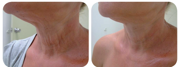
Before and 3 months after 3 treatments