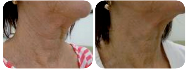
Before and 3 months after 3 treatments